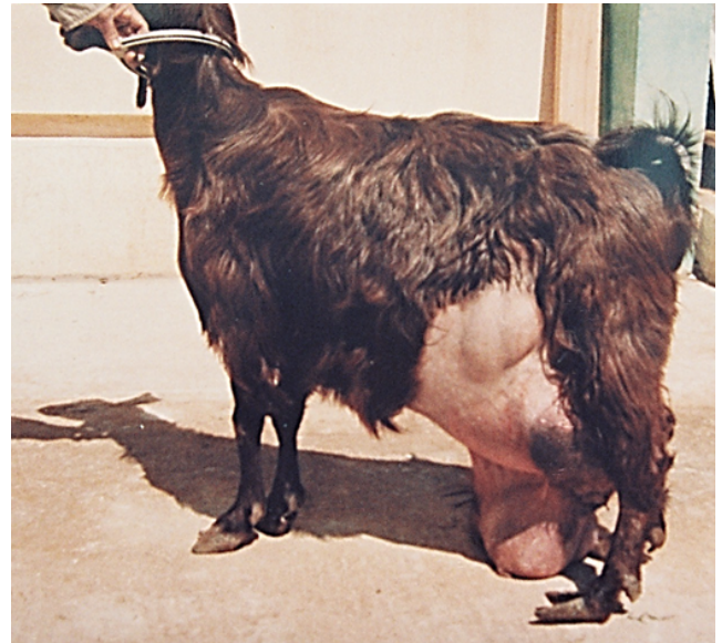
Figure 2 Adult pregnant Shami breed doe with rupture of the prepubic tendon. Notice the mammary glands were dropped on the ground which exposes the animal to injury and possible infection.

Caesarean sections revealed the presence of three fetuses in one doe and two fetuses in each of the other two does within apparently normal uteri. The abdominal floor was normal and no hernia was detected. The three does survived the surgeries and recovered from anesthesia uneventfully.